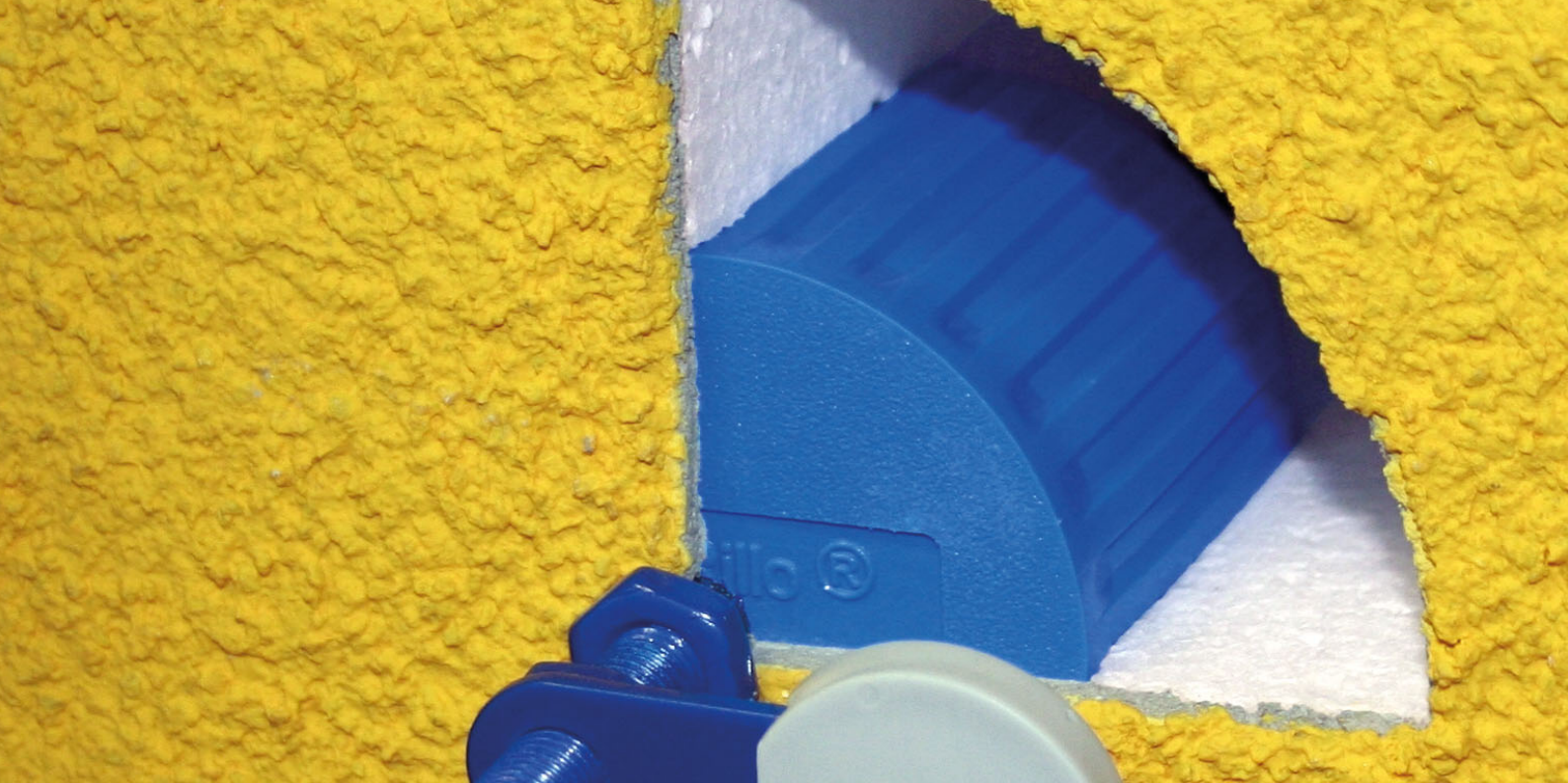
Fixation cylinder ZyRillo®-PE